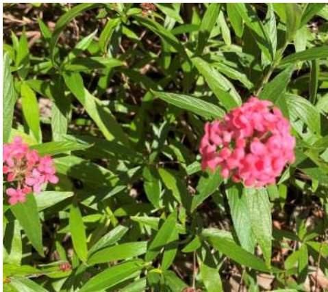
Panama Rose in the Front Porch Bed