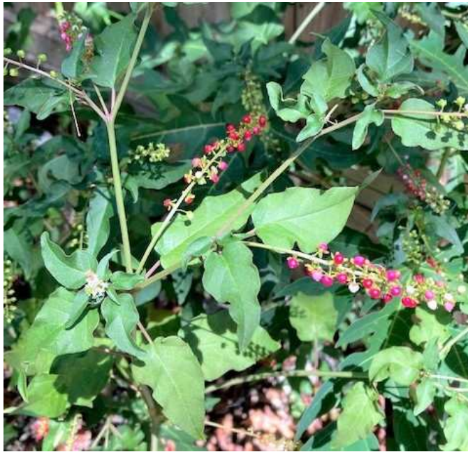
Rougeberry propagates readily, as I discovered at my mother's house near Pennekamp State Park.