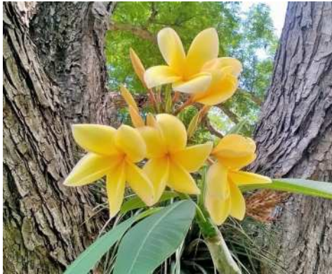
Plumeria in the Bridal Bouquet Bed