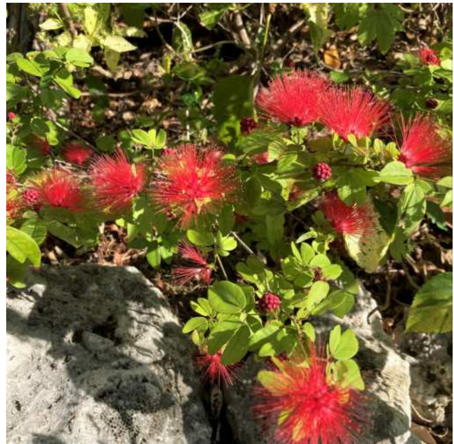
Dwarf Powderpuff in the East Sunroom Garden