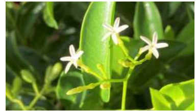
Pearlberry in the Front Berm

Rainy weather has finally returned to the gardens! Although it's only been a few showers over the past 3 weeks, it's been enough to encourage some of our plants to push out new shoots and blossoms. Even though the gardens are watered regularly, the plants seem to know and thrive when the rain falls. Some of the trees that shed leaves because of the drought conditions are also leafing out again. Most of the gumbo limbo trees sprout leaves in early spring, but dropped them again when the rains failed to come in March and April.