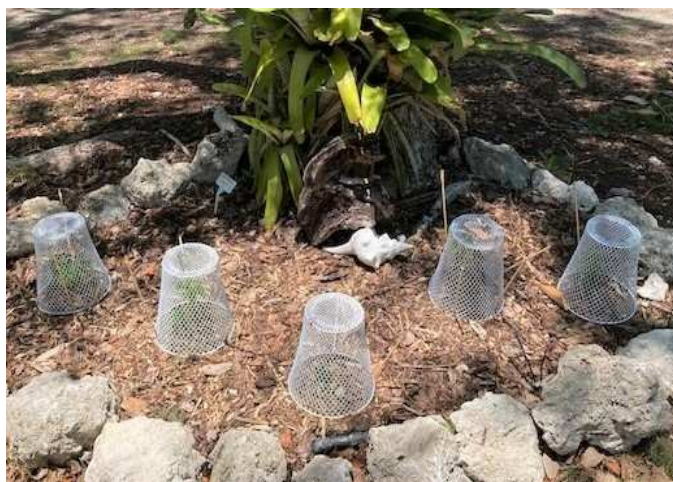
Small wire baskets covering the rougeberry plants to protect them from hungry curly-tail lizards or iguanas.

They are small and rather inconspicuous, and the curly-tail lizards kept eating all the new leaves so it was difficult to know what they would look like when they matured. Looking for a solution, I found some small wire baskets at the dollar store that are similar to the chicken wire cloches sold at places like Gardener's Supply Company for $20+ apiece. Lonell and I covered the plants with the baskets, using bamboo skewers to hold them down. The baskets seem to be working, so I went back and bought all the ones remaining in the Key Largo store. There are 10 baskets in the outdoor storage shed, so please help yourself if you need to protect any new young plants in one of your adopted beds.