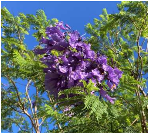
Jacaranda Tree at southeast corner of property