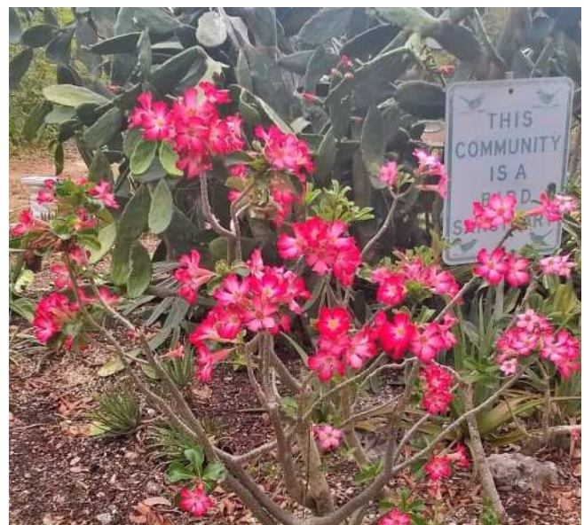
Desert Rose in the Cactus Garden