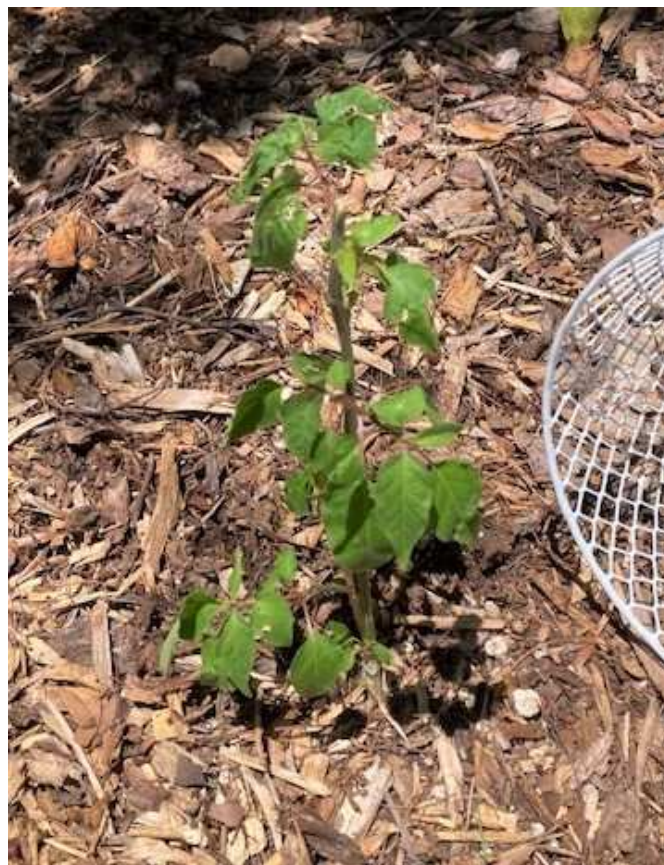
One of the small rougeberry plants in the rougeberry bed at the Francis Tracy Garden Center. The small baskets are successfully keeping curly-tails from eating all of the new leaves.

The genus name Rivina came from German physiologist and professor of botany Augustus Rivinus, and humilis