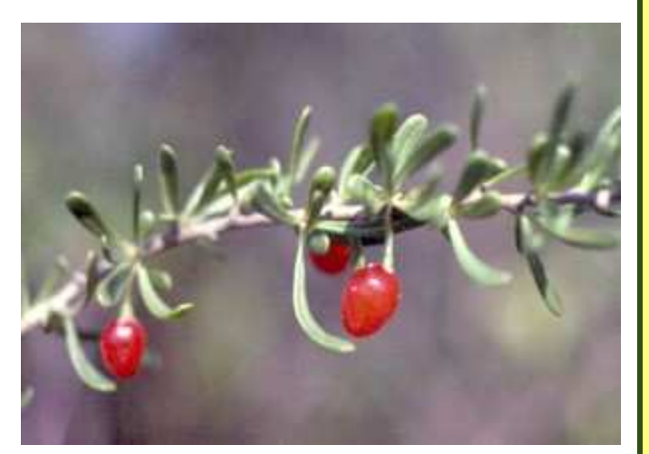
Christmasberry was aptly named for it's bright red berries that are often present around Christmas.

This plant is in the tomato/potato family (Solanaceae or Nightshade family) and is a relative of the Goji berry ( L. barbarum , L. chinense ). It is also called Carolina Desert -thorn because of the thorns that sometimes grow on its branches.